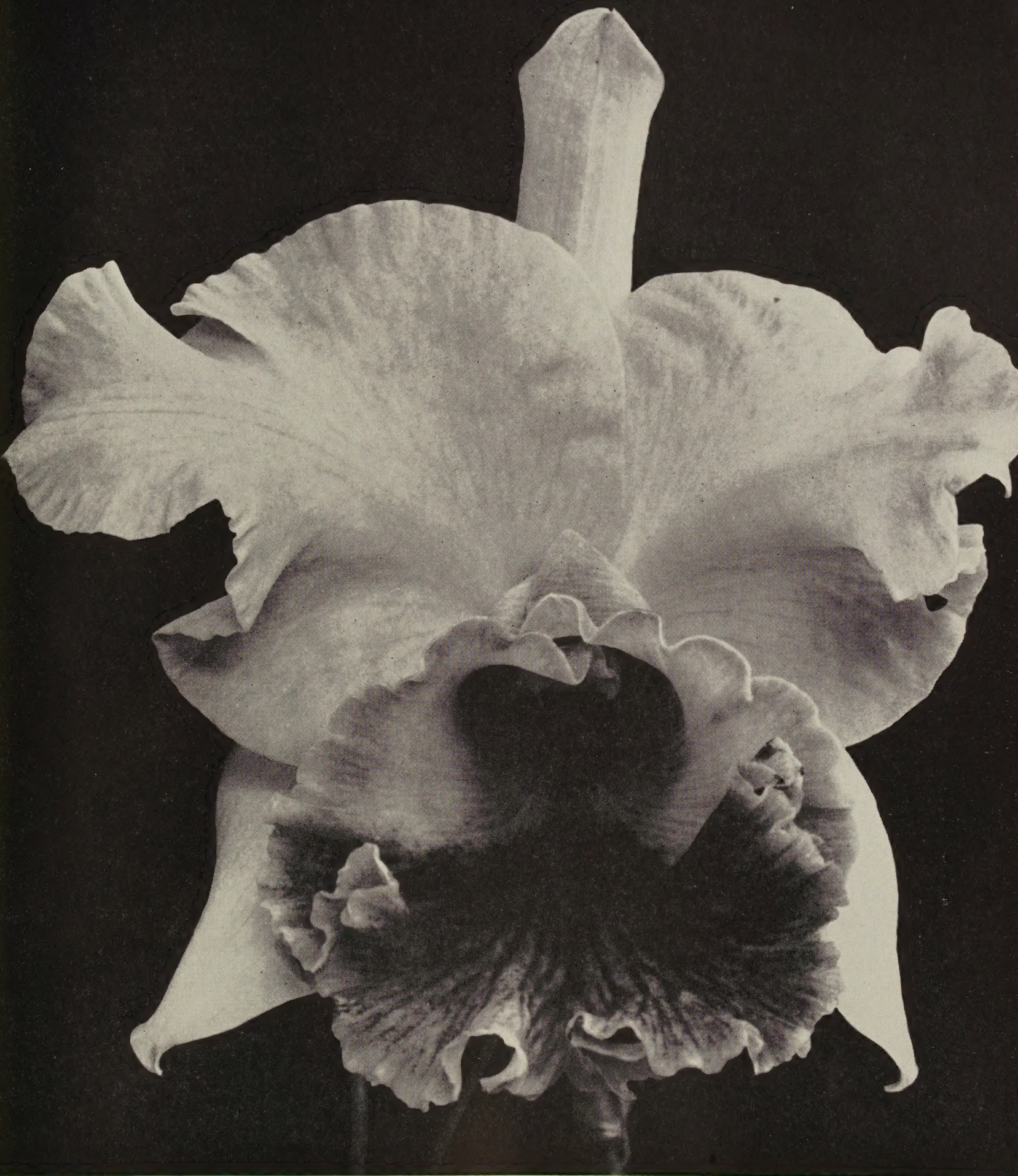
Laeliocattleya Treasurer Cross No. 3251